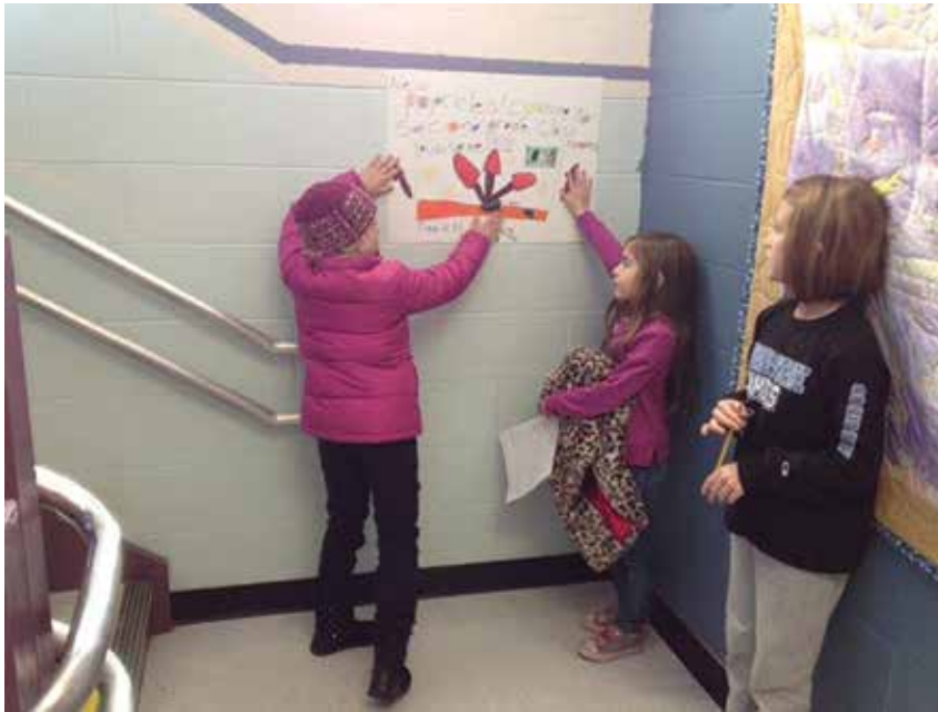
Students display a poster.

focused on the process of the project, not how fun it was to make ice pops. Each of the five groups focused on a different aspect of the project: making recipes, researching on iPads, interviewing the nutritionist, tasting and voting, and marketing. To demonstrate what they had learned in each phase, students used digital pictures, recorded their voices, and drew their own images. After that, students showed their presentations to administrators and gave a short summary of their part of the project. Administrators asked probing questions and students relayed their understanding. Students had many takeaways: