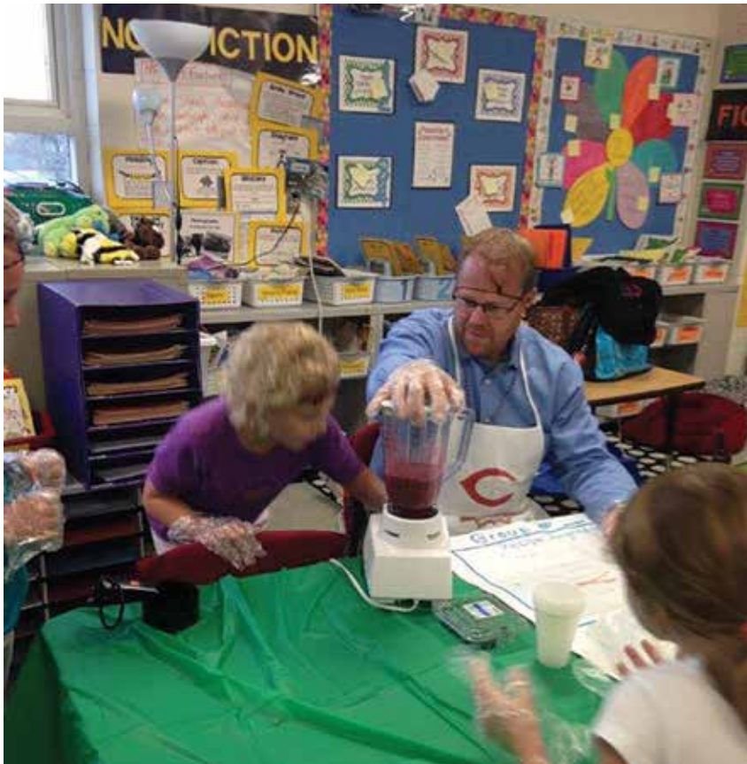
Adult volunteers help students blend their recipes.

health websites (see Internet Resource). Symbaloo is a free site that allows any teacher to create a board or grid of links to multiple websites. The tiles can be customized by color, symbol, or name to allow a teacher to group by topic—e.g., sample recipes, health information, and so on. The teacher can create the Symbaloo and share the site link with students, where they find a structured place to search within the teacher-designated sites. If a new site needs to be added quickly, the teacher can update the Symbaloo on the fly and refresh it for students to use almost immediately.