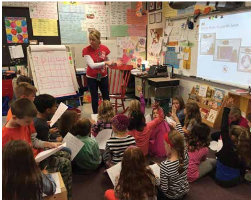
The class ranks its favorite recipes.

Prior to class the next day, parent volunteers were recruited to reproduce all the recipes in bulk quantity. Small paper cups were filled three-quarters full and were frozen in the teachers' lounge. During class, each student was given a sample of the other groups' recipes and voted on their favorites (see NSTA Connection). Examples of the flavors included "Berry-Banana-Pineapple" or "Cherry-Orange-Banana-Raspberry." All groups decided to use fruits and not vegetables based on taste. Students were required to record data about why they did or did not like a specific recipe. We coached students to think about specific aspects when rating their choices. For example, students needed to think about taste, thickness, and aroma, to name a few. Ultimately, they ranked their favorite choices on scale of 1–5, with 1 being their favorite and 5 being their least favorite. If students didn't like the taste of an ice pop, they would say such things as: "This one is too tart!" or "This needs more cherries!"